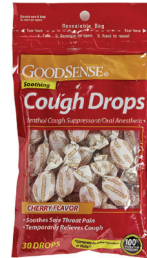
Cough Drops, Cherry Count: 30