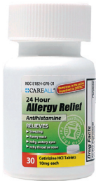
Cetirizine Allergy Tablets, 10 mg. Count: 30