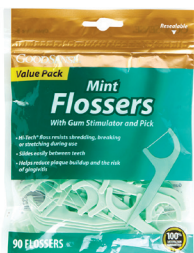
Interdental Flossers Count: 90