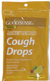
Cough Drops, Honey Lemon Count: 30