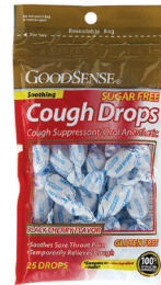
Cough Drops, Sugar-Free Count: 25