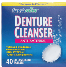
Denture Cleaning Tablets Count: 40