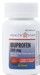
Ibuprofen Tablets, 200 mg. Count: 50 ct.