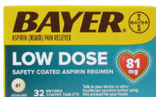
Bayer® Enteric Coated Aspirin, Low Dose, 81 mg. Count: 32 ct.