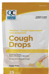
Cough Drops, Sugar-Free Count: 25 ct.