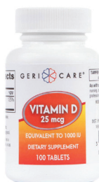
Vitamin D3, 25 mcg.† Count: 100 ct.