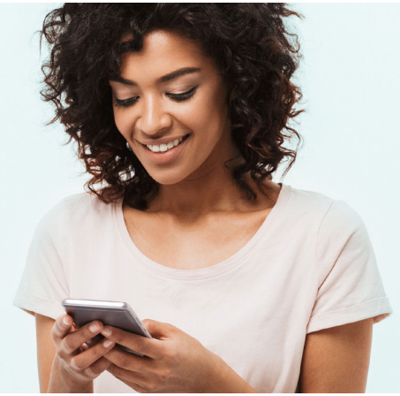
MedImpact Consumer Portal