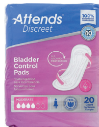
Attends® Discreet Women's Moderate Bladder Control Pad* Count: 20 ct.