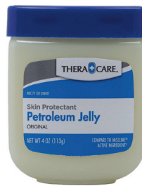
Petroleum Jelly, 4 oz. Count: 1 ct.