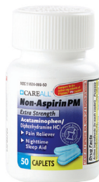
Acetaminophen PM Extra Strength Caplets, 500 mg., 25 mg. Count: 50 ct.