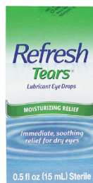
Lubricating Eye Drops, Refresh Tears®, 15 ml. Count: 1 ct.