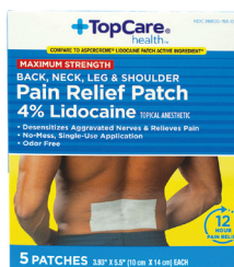
Lidocaine Patch, 4% Count: 5 ct.