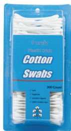
Cotton Swabs Count: 300 ct.