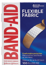
Band-Aids®* Count: 100 ct.