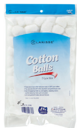
Cotton Balls Count: 100 ct.