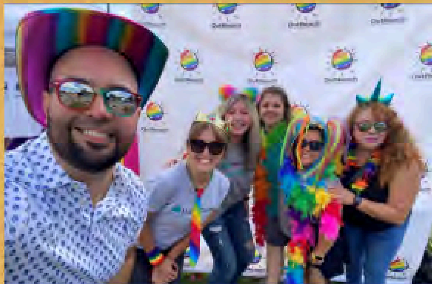
Team Molina volunteered to work the photo booth at Magic Pride Fest in Madison hosted by OutReach LGBTQ+ Community Center, where we were also one of the sponsors and tabled at the event.