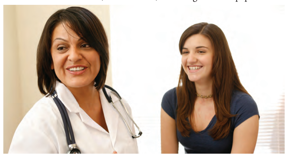
Getting Care for Special Health Care Needs

You can go see women's health specialists for your routine and preventive health care. Women's health specialists include obstetricians, gynecologists, and certified nurse midwives. Routine and preventive care includes care before birth, breast exams, mammograms and pap tests.