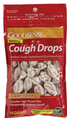
Cough Drops, Cherry Count: 30