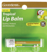
Medicated Lip Balm, 0.15 oz. Count: 1