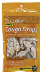
Cough Drops, Honey Lemon Count: 30