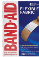
Band-Aids®* Count: 100