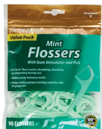
Interdental Flossers Count: 90