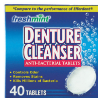
Denture Cleaning Tablets Count: 40