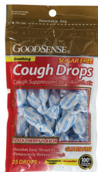
Cough Drops, Sugar-Free, Black Cherry Count: 25