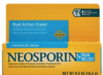
Neosporin® Plus, 0.5 oz. Count: 1