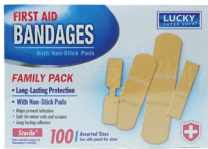
Bandages, Assorted* Count: 100