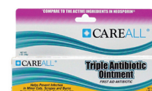
Triple Antibiotic Ointment, 1 oz. Count: 1