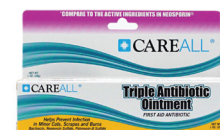
Triple Antibiotic Ointment, 1 oz. Count: 1