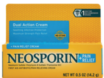
Neosporin® Plus, 0.5 oz. Count: 1