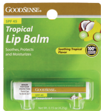
Medicated Lip Balm, 0.15 oz. Count: 1