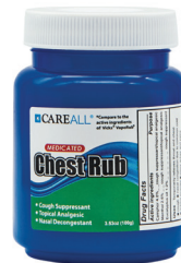
Vapor Rub, 3.5 oz. Count: 1