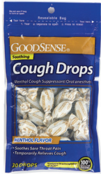
Cough Drops, Menthol Count: 30