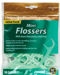
Interdental Flossers Count: 90