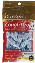
Cough Drops, Sugar-Free, Black Cherry Count: 25