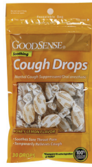
Cough Drops, Honey Lemon Count: 30