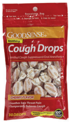
Cough Drops, Cherry Count: 30