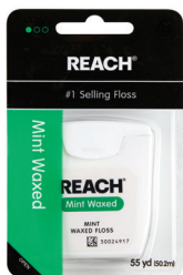
Dental Floss, Reach®, Mint Waxed Count: 1