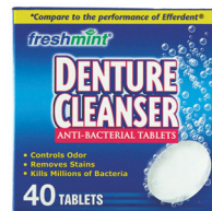
Denture Cleaning Tablets Count: 40