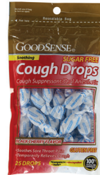
Cough Drops, Sugar-Free, Black Cherry Count: 25