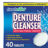
Denture Cleaning Tablets Count: 40