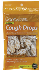
Cough Drops, Honey Lemon Count: 30