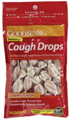
Cough Drops, Cherry Count: 30