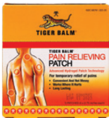
Tiger Balm® Patch, Regular Count: 5