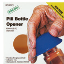
Pill Bottle Opener Aid Count: 1