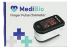
Pulse Oximeter † Count: 1