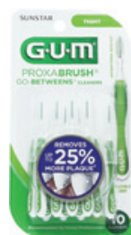
Interdental Gum Brushes Count: 10