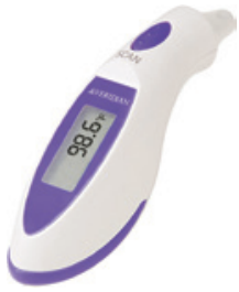
Thermometer, Digital Ear Count: 1