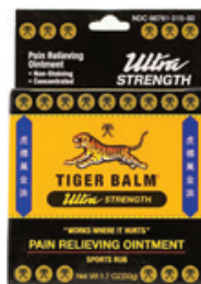
Tiger Balm® Ointment, Ultra Strength, 1.7 oz. Count: 1