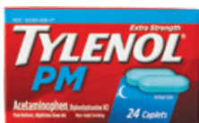
Tylenol® PM Extra Strength Tablets, 500 mg. Count: 24