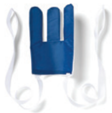
Sock Aid Count: 1