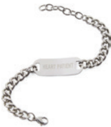
Medical ID Bracelet, Heart Count: 1