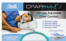
CPAP Pillow Memory Foam Count: 1