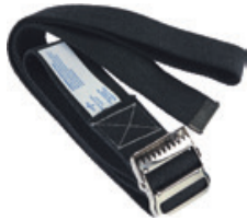
Gait Belt, 72" Count: 1