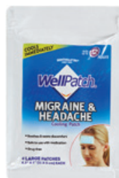
Wellpatch® Migraine Count: 4