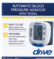
Blood Pressure Monitor, Wrist † Count: 1