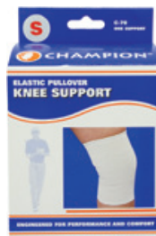
Knee Support, Elastic, Small Count: 1