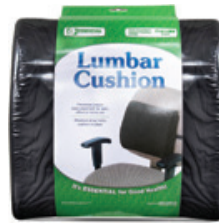
Cushion, Lumbar Count: 1