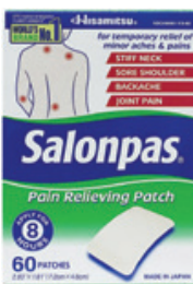
Salonpas® Patch, Small Count: 60