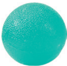
Gel Hand Exerciser Ball, Extra Firm Count: 1