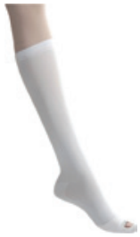
Anti-Embolism Stockings, X-Large Count: 1 pair