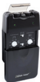
Tens Unit, Analog Count: 1