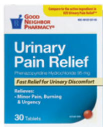
Urinary Pain Relief, 95 mg. Count: 30