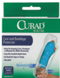
Cast, Bandage & Wound Protector, Arm Count: 2