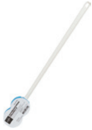
Long Handle Bath Sponge Count: 1