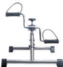
Pedal Exerciser Count: 1