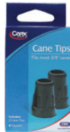
Cane Tip, 3/4" Count: 1