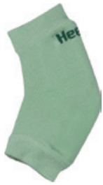
Heel & Elbow Protector, X-Large Count: 1