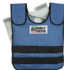
Cooling Vest, X-Large Count: 1