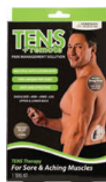
Tens Unit, Digital Count: 1