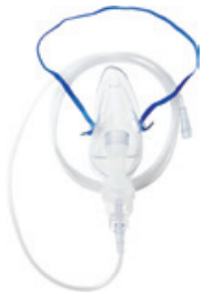
Adult Nebulizer Mask with Tubing† Count: 1