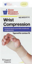
Wrist Compression, Large Count: 1