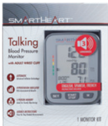
Blood Pressure Monitor, Wrist Talking+ Count: 1