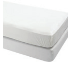
Elastic Mattress Cover, 80" x 36" x 6" Count: 1