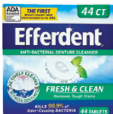
Efferdent® Plus Mint Tablets Count: 44