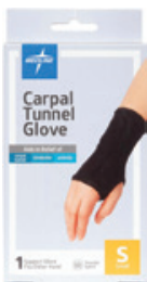
Carpal Tunnel Glove, Small Count: 1