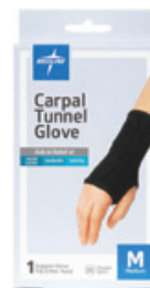
Carpal Tunnel Glove, Medium Count: 1