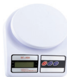
Kitchen Scale, Digital† Count: 1