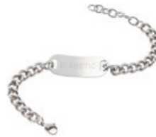
Medical ID Bracelet, Diabetic Count: 1