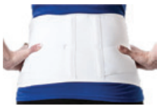
Back Support Elastic with Lumbar Count: 1