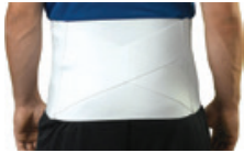
Deluxe Criss Cross Back Support, Small, 28" to 32" Count: 1