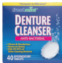
Denture Cleaning Tablets Count: 40