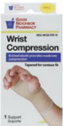
Wrist Compression, Small Count: 1