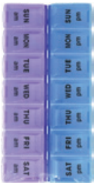
Pill Box, 7 Day, AM & PM Count: 1