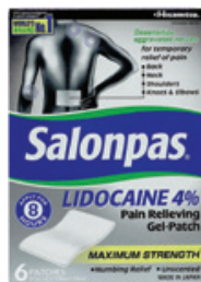
Salonpas® Patch, Lidocaine, 4% Count: 6