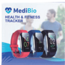
Activity Tracker Count: 1