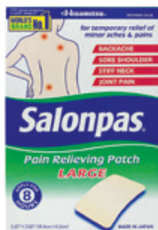
Salonpas® Patch Count: 6