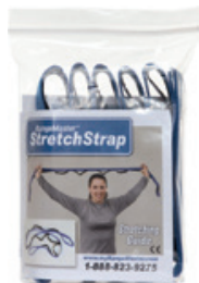
Stretch Strap Count: 1