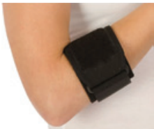
Tennis Elbow Support Count: 1