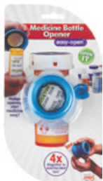
Medicine Bottle Opener with Magnifier Count: 1