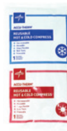
Hot Cold Reusable Pack, 5" x 10" Count: 1