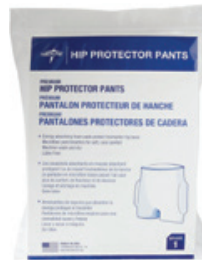
Hip Protector, Large Count: 1