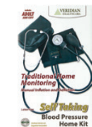
Blood Pressure Monitor, Manual † Count: 1