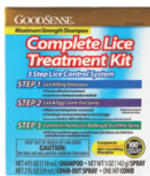
Lice Elimination Kit Count: 1 kit