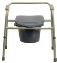
Bedside Commode* Count: 1