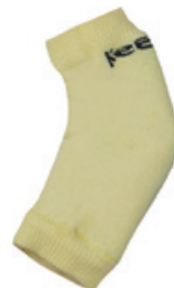
Heel & Elbow Protector, Small Count: 1