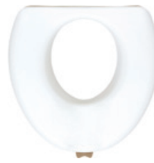
Raised Toilet Seat, Locking Count: 1