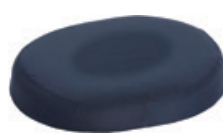
Cushion, Foam Ring Count: 1