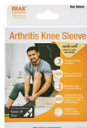
Arthritis Knee Sleeve, Large Count: 1