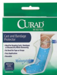
Cast, Bandage & Wound Protector, Leg Count: 2