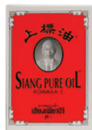
Siang Pure Oil Original Red Formula, 7 ml. Count: 1