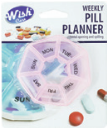
Pill Box, 7 Day, 1 Time a Day Count: 1