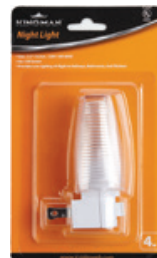
Night Light Count: 1