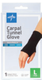
Carpal Tunnel Glove, Large Count: 1