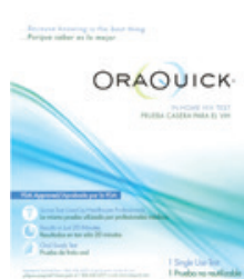
HIV Test† Count: 1