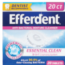
Efferdent® Tablets Count: 20