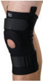
Support, Knee with U-Buttress, Large Count: 1