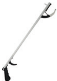
Reaching Aid Device Count: 1