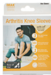
Arthritis Knee Sleeve, Small Count: 1