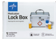
Medication Lock Box Count: 1