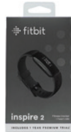
Fitbit Inspire 2™, Black Count: 1