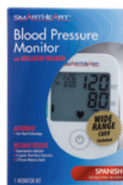
Blood Pressure Monitor, Upper Arm Automatic † Count: 1