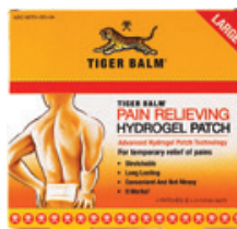
Tiger Balm® Patch, Large Count: 4