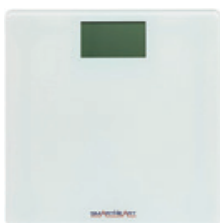
Bathroom Scale, Digital †§ Count: 1