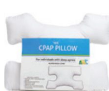
CPAP Pillow Fiber Filled Count: 1