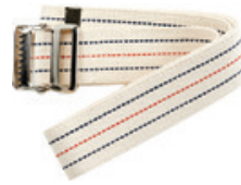
Gait Belt, 60" Count: 1