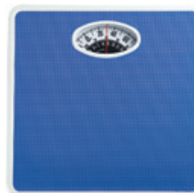
Bathroom Scale, Dial †§ Count: 1