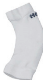
Heel & Elbow Protector, Large Count: 1