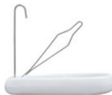
Button & Zipper Aid Count: 1