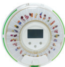
Automatic Pill Dispenser Count: 1