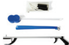
Rehab & Hip Kit (Reacher, Shoehorn, Sock Aid, Bath Sponge) Count: 1