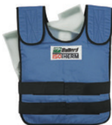
Cooling Vest, Large Count: 1