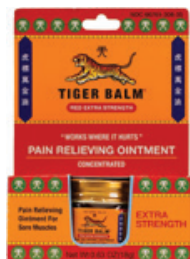
Tiger Balm® Ointment, Extra Strength, 0.63 oz. Count: 1