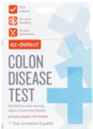
EZ Detect™ Colon Cancer Test Kit† Count: 1