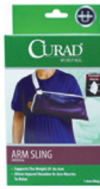
Arm Sling Count: 1