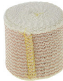
Elastic Bandage, 2" x 4.5 yd.* Count: 1