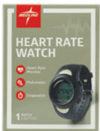
Heart Rate Monitor Watch† Count: 1