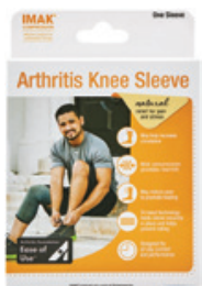
Arthritis Knee Sleeve, Medium Count: 1