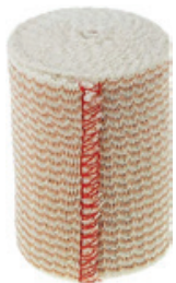
Elastic Bandage, 3" x 5 yd.* Count: 1