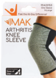
Arthritis Knee Sleeve, X-Large Count: 1