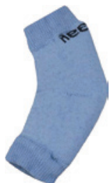
Heel & Elbow Protector, Medium Count: 1