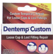
Loose Cap and Filling Repair Count: 1