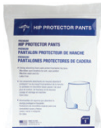
Hip Protector, X-Large Count: 1