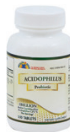
Acidophilus Probiotics, 500 mm.‡ Count: 100