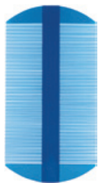
Lice Comb Count: 1