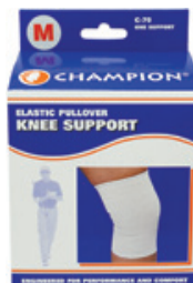
Knee Support, Elastic, Medium Count: 1