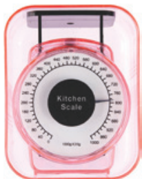
Kitchen Scale, Dial† Count: 1