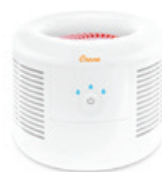
Air Purifier Count: 1