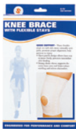
Knee Support, Elastic, Small with Stays Count: 1