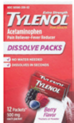
Tylenol® Extra Strength Dissolve Packs, 500 mg. Count: 12