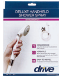
Handheld Shower Head Count: 1