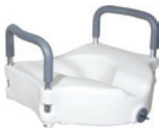
Raised Toilet Seat with Arms Count: 1