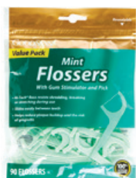
Interdental Flossers Count: 90