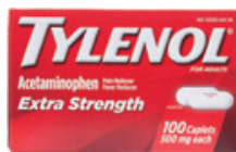
Tylenol® Extra Strength Tablets, 500 mg. Count: 100