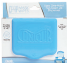
CPAP Mask Wipes Count: 72