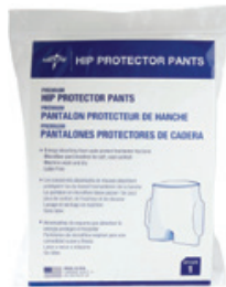
Hip Protector, Medium Count: 1