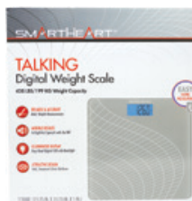
Bathroom Scale, Digital Talking †§ Count: 1