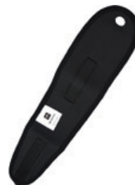
Wrist Support Count: 1