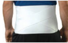
Deluxe Criss Cross Back Support, Medium, 33" to 37" Count: 1