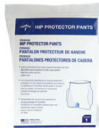
Hip Protector, Small Count: 1