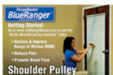
Shoulder Pulley Count: 1