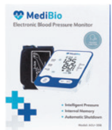
Blood Pressure Monitor, Upper Arm Talking † Count: 1