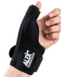
Thumb Brace Count: 1