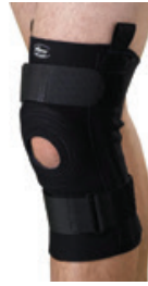
Support, Knee with U-Buttress, X-Large Count: 1