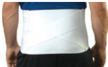
Deluxe Criss Cross Back Support, Large, 38" to 42" Count: 1